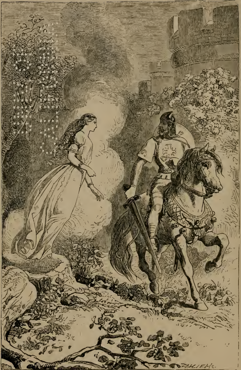
St. Denis of France.